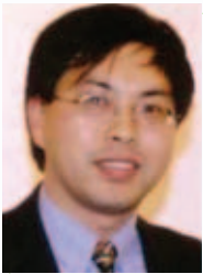
BSc, MEng, PhD