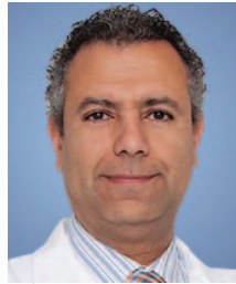
MD, FIPP (USA)