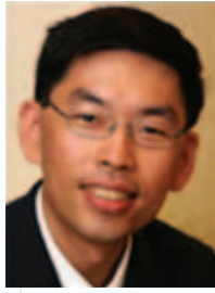
Pain Management Services, The Pain Specialist